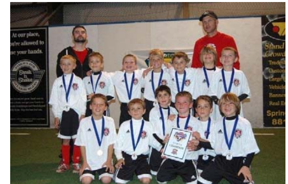
Springfield S.C. 00/01 Boys Incredible Pizza Fall Classic Champions

“Where Good Teams Begin the Road to Becoming Great”